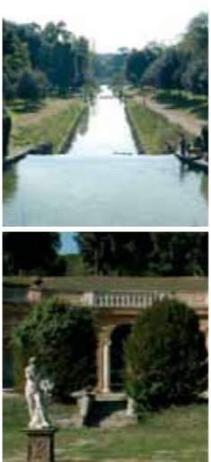
Casa del Cinema