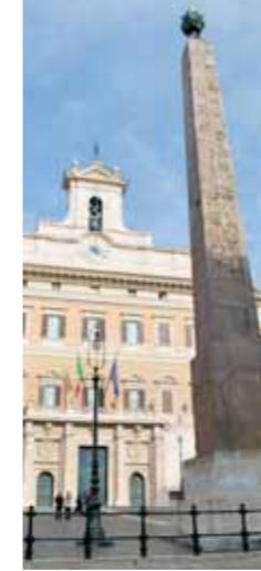
Trinità dei Monti

Impressive constructions, several times "shifted" in the course of the centuries