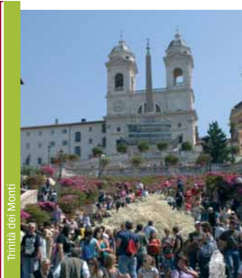
Trinità dei Monti

The Obelisk of Montecitorio. At present this stands in Piazza Montecitorio. It is of granite and is about 34 metres in height (21.79 metres plus the base and the globe). It came from Heliopolis where it was erected in 594-598 BC