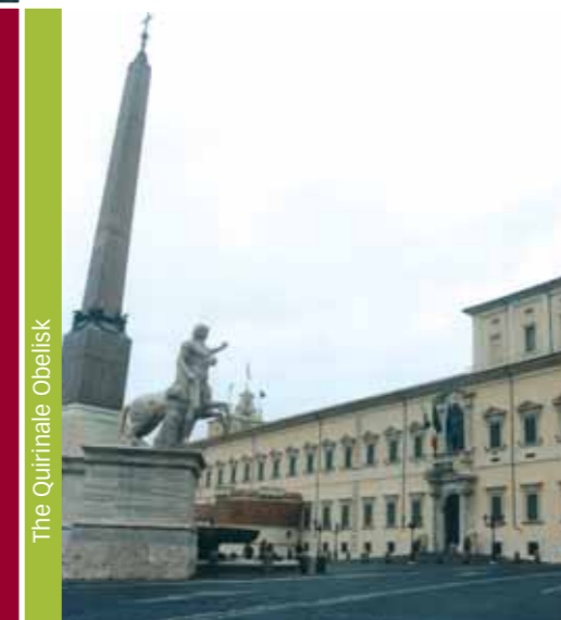
The Quirinale Obelisk