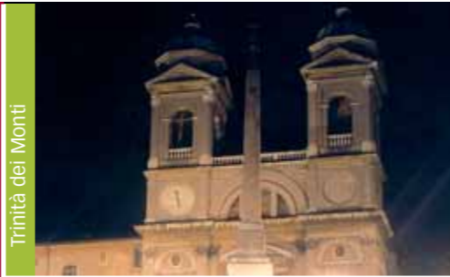
Trinità dei Monti