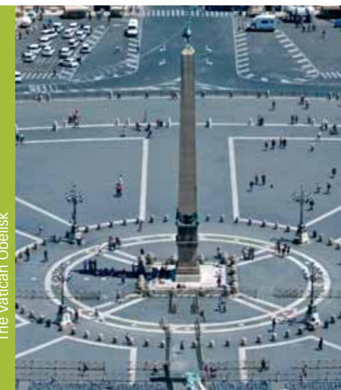
The Vatican Obelisk

The Flaminian Obelisk. This is in the centre of Piazza del Popolo. It is 24 metres in height, and counting the base and the cross it reaches 36.50 metres. It takes its name from the ancient Via