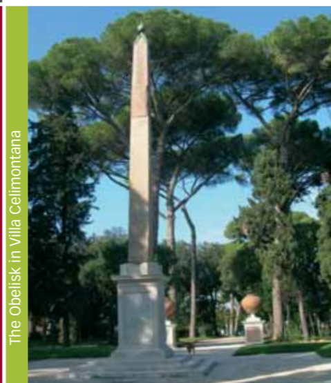
The Obelisk in Villa Celimontana

The Esquiline Obelisk is in Piazza dell'Esquilino and was the second obelisk erected in Rome by Pope Sixtus V. It is about 25.50 metres high and dates probably from the times of Domitian; without any hieroglyphs, it was original-