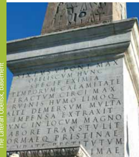
The Lateran Obelisk, basement