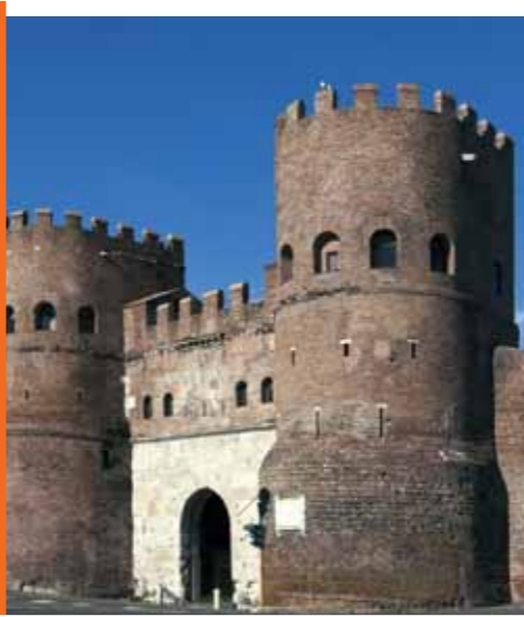
Porta San Paolo