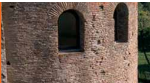
Museum of the Walls

In Via dei Fori Imperiali, at the crossing with Via Cavour, is the Torre dei Conti, built in the 13th century and known in the Middle Ages as the "Torre Maggiore" because of its massive structure. Behind it, going up Via Tor