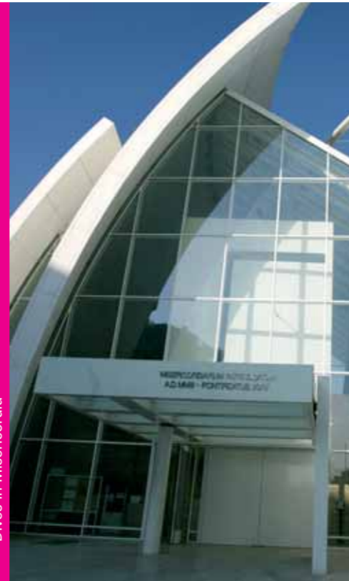
Dives in Misericordia

Even if slightly away from the usual tourist circuits, it is worth while making our way to the outskirts district of Tor Tre Teste, where the “Church of the Third Millennium”, the Dives in Misericordia, the work of the American