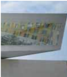
The Square Colosseum